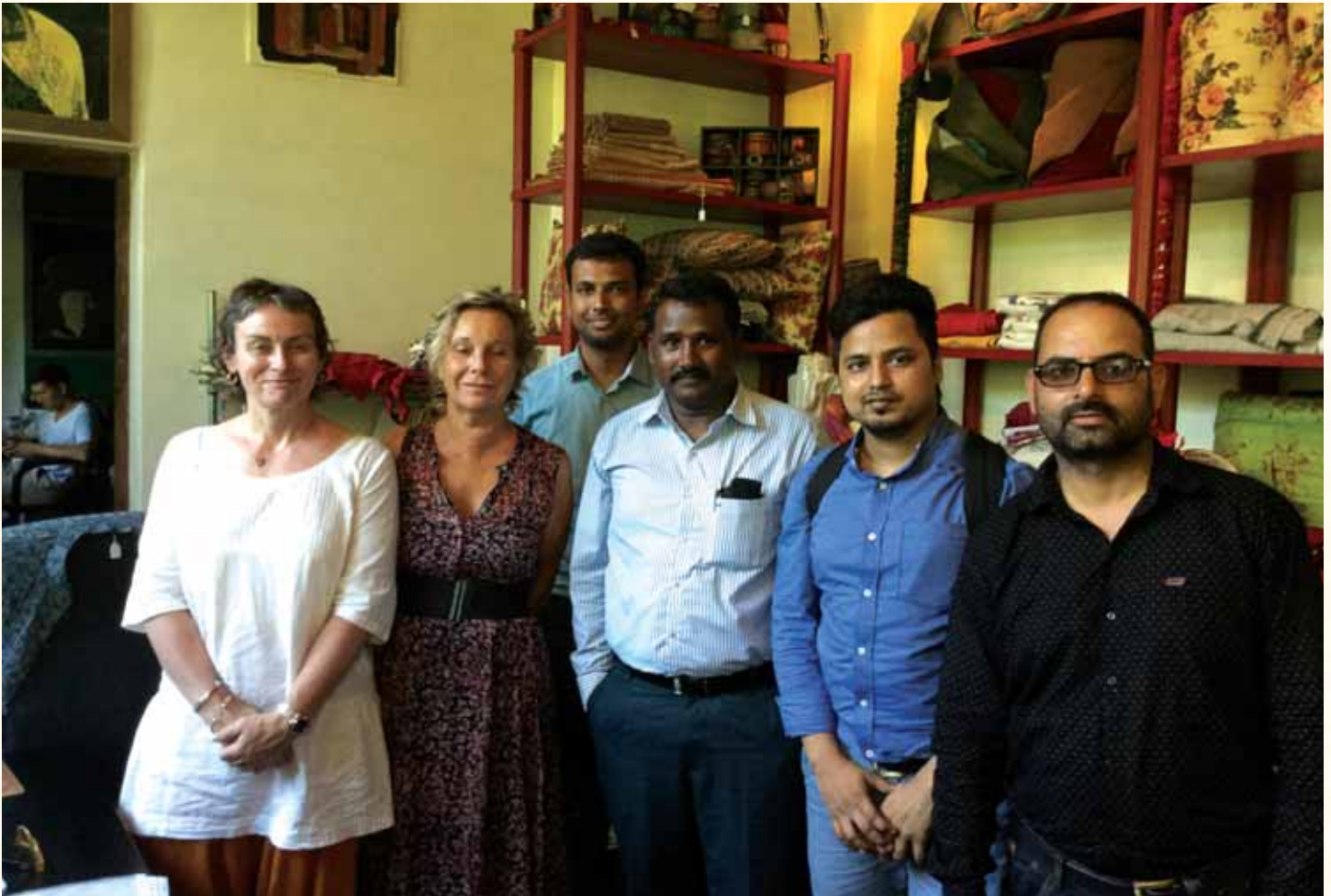
Participants : One-to-one meeting with buyers

The remote location of the exhibition venue had resulted in inadequate response of business visitors which otherwise would have generated good results, especially since Italy is a very good market for Indian handlooms. On assessment of this inadequate response with the assistance of Indian Embassy, Council organised one to one meetings at Rome for India Handloom Brand participants and interested exporters. Four such meetings with buyers were arranged. Of these four, three were boutiques and one was a dealer of fabrics. Among the boutiques, two are owned by Italians handling exclusive Indian handloom products. The owners who had started liking handloom products during their visit to India, have been sourcing their requirements from different parts of India ever since their visit. Interestingly, the end users of these products are also exclusively Italians and not person of Indian origin. The products include stoles, scarves, etc. Upon listening to features of Indian Handloom Branded (IHB) products, both of them have expressed their desire to source from the IHB participants from Kashmir, Varanasi, Pochampally etc. IHB participants had business negotiations with them and are likely to get orders, though in small volumes, but regular orders. The dealer of fabric liked the samples of all IHB participants as well as of the exporter from Karur who was part of the team that visited Rome. They have initiated business negotiations and are likely to convert it to business.