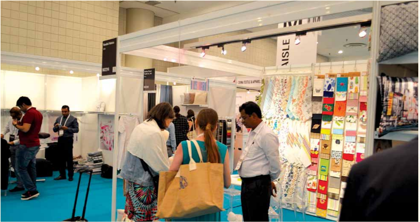
Stall view of HEPC participants