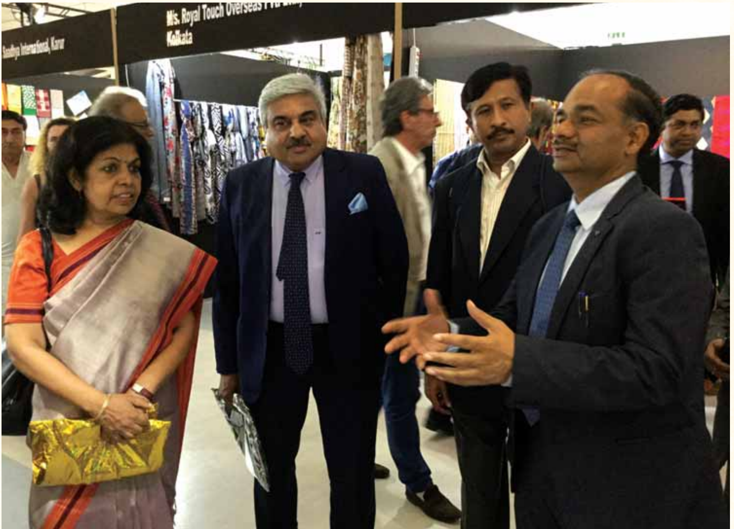
Secretary (Textiles), Ambassador of India at Italy and Development Commissioner (Handlooms) visiting HEPC Participants stalls